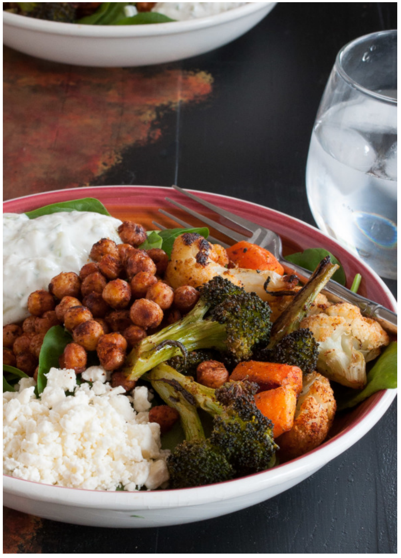
<u>Instagram Post Stories-22641389</u>